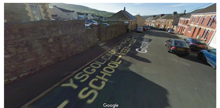
Fig. 6 – Historical Parking Restrictions along Grosvenor Terrace

It should also be noted that the development itself will provide adequate off-street parking to serve future occupiers of the development which should ensure that no vehicles from this proposed development migrate onto Talana Terrace or Grosvenor Terrace.