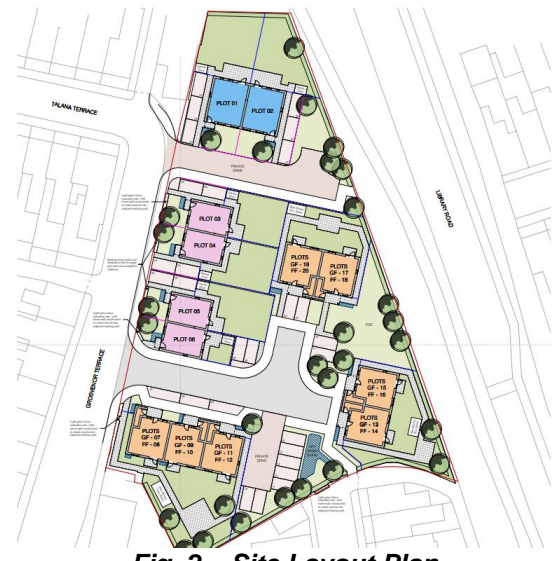
Fig. 2 – Site Layout Plan