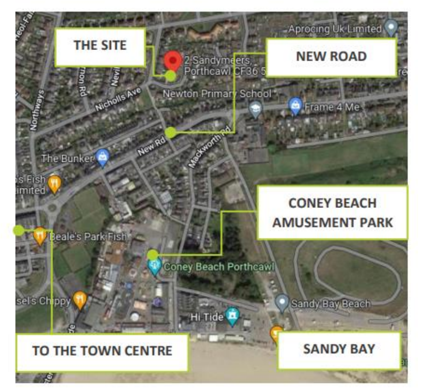
Fig. 3 - Location of site in relation to town centre and other tourism locations

The location of the proposed site is considered within the town centre area as per the Local Development Plan boundaries and within easy walking distance to Coney Beach, Sandy Bay and the town centre of Porthcawl (as described in the Planning Statement by the agent of the applicant).