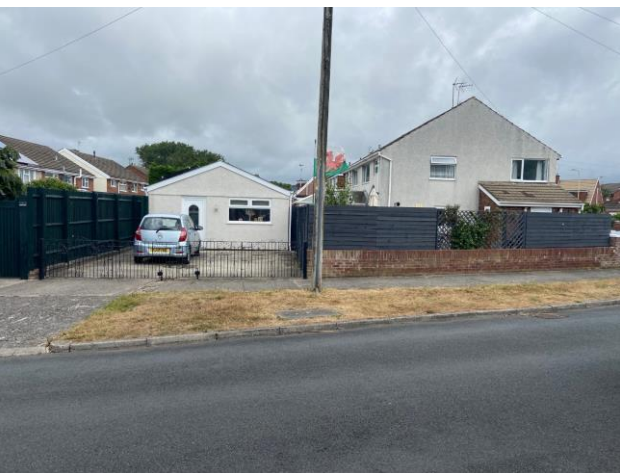
Fig. 6 - The existing driveway to be widened

The existing driveway and drop kerb will also be widened to allow for good access onto the drive/parking courtyard and suitable visibility. On balance, it is considered that the proposed parking arrangements are acceptable and the final scheme will be the subject of a condition. The provision will ensure that there is sufficient off-street parking to serve the holiday let unit and the main house without impacting the free flow of traffic along the culde-sac.