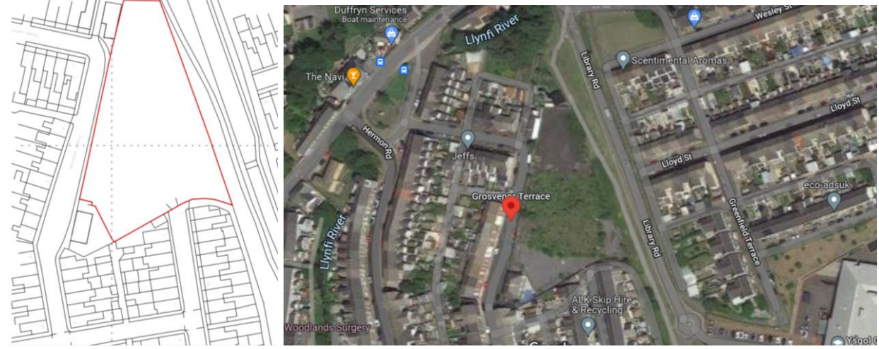
Fig. 1 – Site Location Plan and Aerial View

The site measures approximately 0.39ha and is located on the eastern side of Grosvenor Terrace.