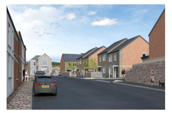
Fig. 4 – Proposed Streetscene fronting onto Grosvenor Terrace

The scale and form of the development seeks to respect its context with two storey dwellings/blocks of flats proposed and sited to limit any impact on existing properties. The proposed palette of materials of natural stone finish in Ashlar pattern to the front and facing brickwork to the side and rear elevations with feature brick and stone detailing and grey fibre cement slates, complements the existing built form in this part of the settlement.