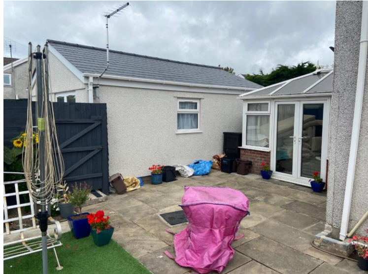
Fig. 4 - Side window to be conditioned to be obscurely glazed and non-opening

In the interests of the amenities of original host dwelling, 2 Sandymeers, the side window that is facing into the private garden of 2 Sandymeers will be conditioned to be obscurely glazed (to Pilkington level 3 obscurity) and to be a non-opening window. In effect, the current window will need to be replaced in order to preserve the adjoining occupier's privacy as it is an opening window and looks over their private amenity space.