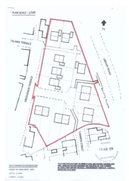
Fig. 5 – Outline Indicative Layout Plan approved under P/16/88/OUT

P/16/88/OUT – Outline consent approved (with conditions) February 2017 Erect 6 three bed detached dwellings and 8 semi-detached dwellings