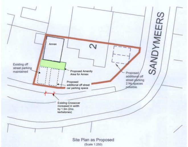
Fig. 2 - Site layout plan showing parking for 2 Sandymeers/Annexe and proposed amenity area for Annex

The proposal also seeks the creation of a front garden amenity space for the annex measuring approximately 7.35 metres wide and 2 metres in length as well as the widening of the current crossover by a further 1.5 metres.