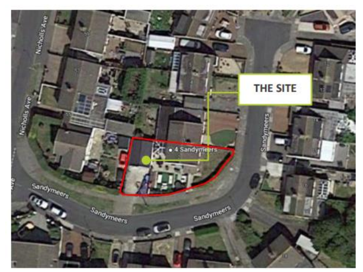
Fig. 1 - The Application Site

The application site forms part of 2 Sandymeers's external garage. Planning consent was originally granted under reference P/19/712/FUL and was subsequently renewed under P/20/498/RLX for the development of an ancillary annex on the site.